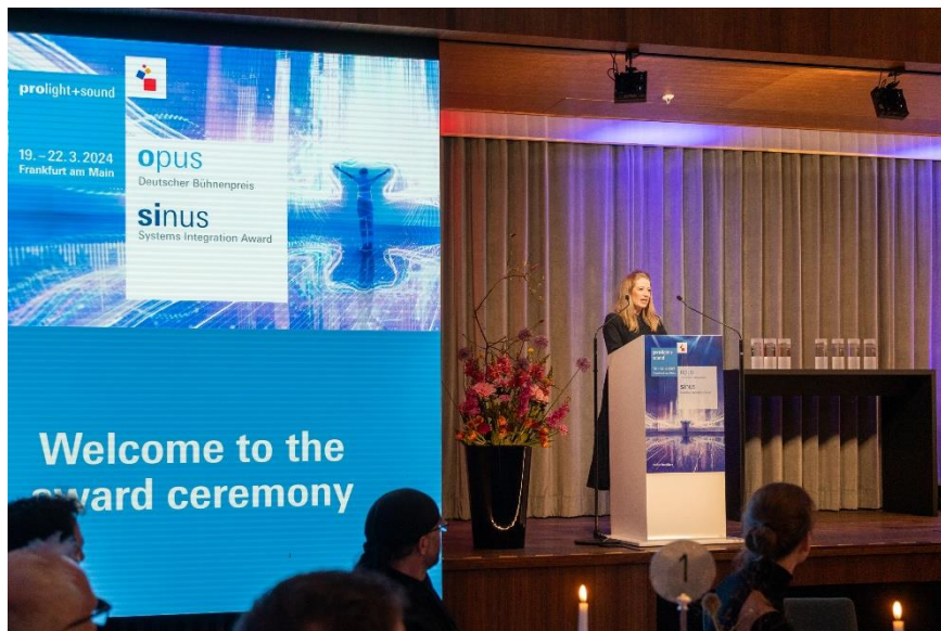
The award ceremony will take place during a gala event.