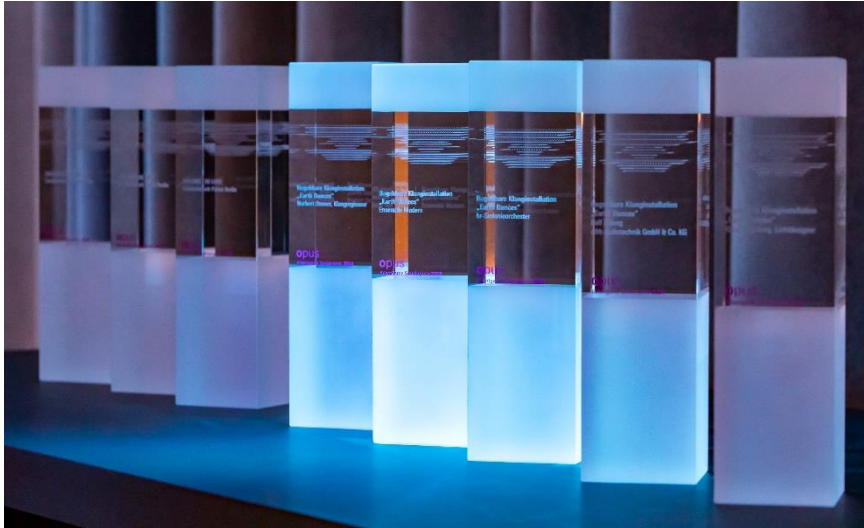
The 'Opus' – a tribute to creativity and innovation.