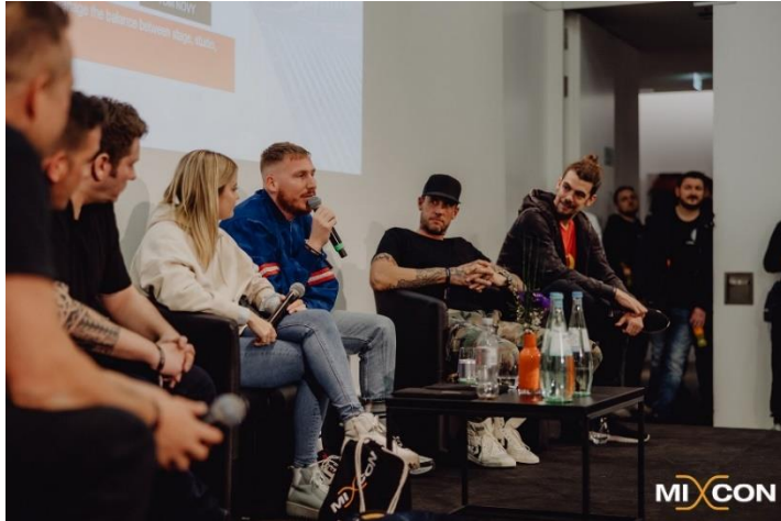
New hotspot for the DJ and music industry at Prolight + Sound: the 'MIXCON x BVD present DJ- & Producer Conference'.