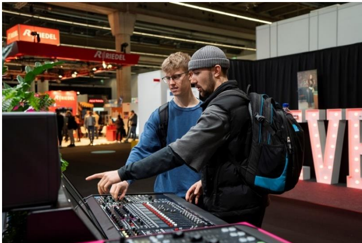
The 'MixLab' offers practical knowledge and interactive demos of the latest mixing desk technologies.