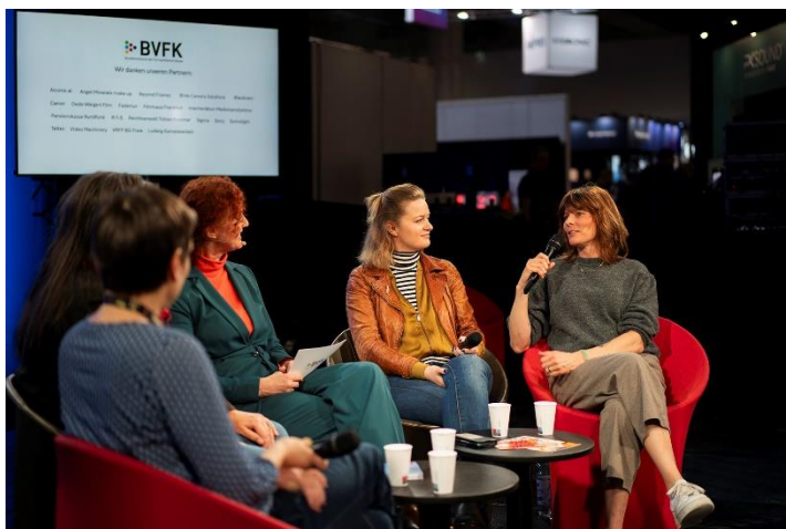
The Image Creation Hub offers inspiring talks and panels with industry professionals.

Prolight + Sound: the world of event technology under one roof