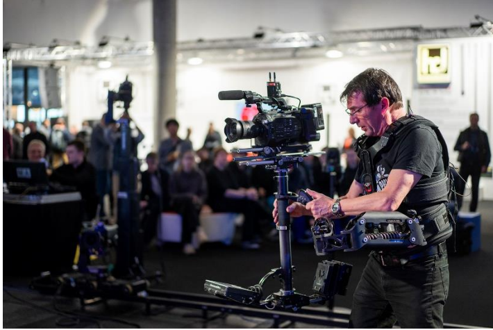
The Image Creation Hub is where practical applications meet expert know-how.