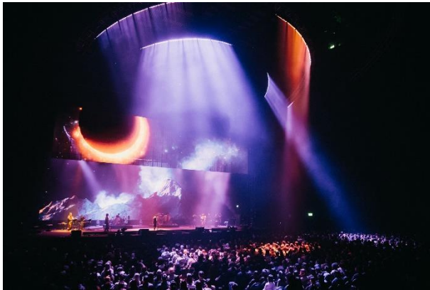
'Heaven & Dirt' concert by the band deca joins.

The carefully orchestrated combination of light, space and sound gave the audience an intense, emotional concert experience, with the aim of giving each visitor the space to have a profound musical experience with the band.