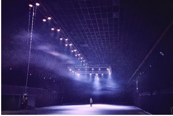
'Visitor' sound installation by Christo Squier.