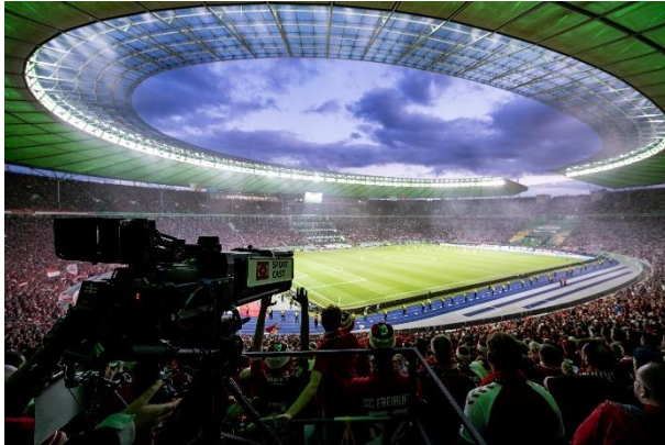
Camera use in the Bundesliga football league.

tactical details and exciting moments for the viewers. Furthermore, numerous matches are produced in UHD-HDR, whereby the visual quality of the production is raised to a new level. By combining technical expertise with a deep understanding of the game, the cameramen working for Sportcast make a decisive contribution to the Bundesliga's media presence.