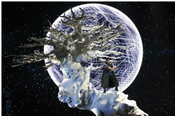
Spectacularly staged: 'The Ring Cycle'.

The critically acclaimed production sets a new benchmark for large-scale opera productions that preserve Wagner's vision while appealing to new audiences. Leigh Sachwitz, founder of flora&faunavisions, explains: 'We have to embrace technology and use it as a tool to create great things. If we can do that, we can also reach younger audiences.'