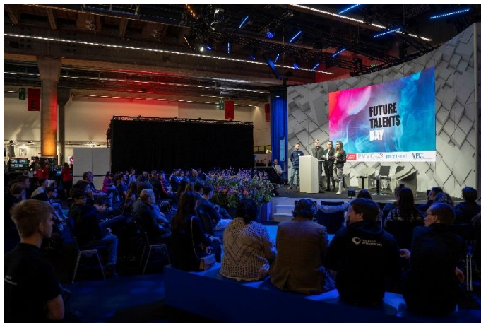
Career inspiration for tomorrow's event professionals: Future Talents Day at Prolight + Sound.

Registration for Future Talents Day is still possible until 4 April 2025 – at https://www.vplt.org/futuretalentsday/ .