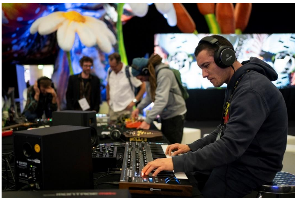
Hands-on technology and knowledge transfer: MusicOneX @ Prolight + Sound