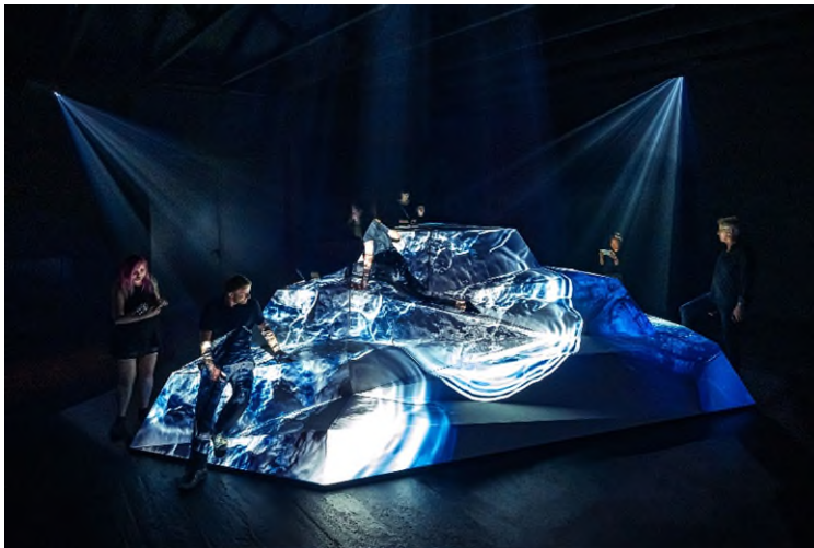
The "Polygon Playground" allows visitors to interact with the projection surface.

Right from the start, visitors to the initial exhibit, “Liquid Sky”, are immersed in a sea of countless points of light that, through their reflection in the room, convey the feeling of a never-ending horizon. The next room, “Inverse”, features kinetic elements and makes 169 black spherical elements appear to come alive against a bright background. The journey continues to the “Circular” installation, where three light rings create an interplay of unity and individuality. A contemplative atmosphere is created by the “Bonfire” exhibit, a virtual campfire simulated using state-of-the-art technology. The fifth room, “Polygon Playground”, presents a seamless, interactive 360° projection onto a central object that reacts to the visitors’ movements via sensors. In the “Grid” room, an impressive spatial sculpture floats and symbolises the fusion of the digital and the physical with kinetics, light and music. Finally, at the “Tone Ladder”, visitors can intuitively create their own worlds of sound by means of movement and touch.